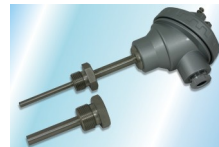
Pockets / Thermowells