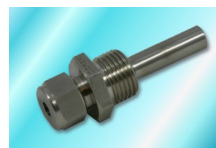
Pockets / Thermowells